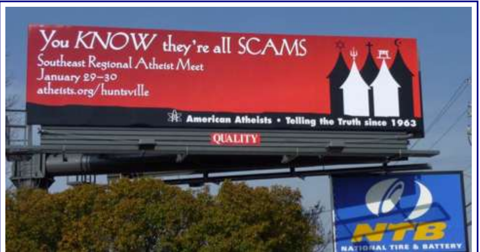
American Atheists advertises for the SERAM meet in Huntsville, AL