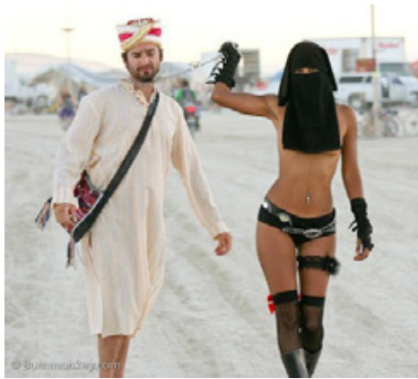
From “Party Girls of Burning Man” by Modern Man Jack http://www.modernmanjack.com/party-girls-of-burning-man-09062014/