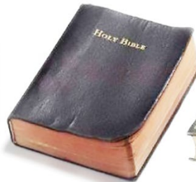
Jewish Adventures II: The Return of the Jew