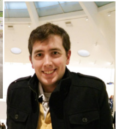
Not pictured: Ross Llewallyn