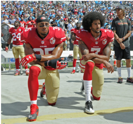
Eric Reid (35) and Colin Kaepernick (7)

“Wouldn't you love to see one of these NFL owners, when somebody disrespects our flag, to say, ‘Get that son of a b*tch off the field right now, out, he's fired? He's fired,’” Trump said at a Sept. 23 rally , referencing pro football players who have been kneeling during the anthem to protest racial injustice. “You know, some owner is going to do that. He's going