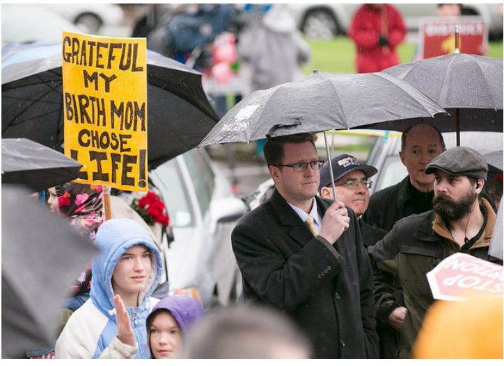
Warrior for an invisible god and Washington state Representative Matt Shea

The manifesto distributed by state Rep. Matt Shea (R-Spokane Valley) conjures up images of a "Holy army" that will overturn marriage equality and legal abortion as well as ban "idolatry and occultism." Openly proclaiming that "God is a Warrior," the document chillingly lays down rules for dealing with those who refuse to obey "biblical law": They should first be given a chance to surrender, but if they choose to resist, they should be invaded, conquered and, in some cases, killed.