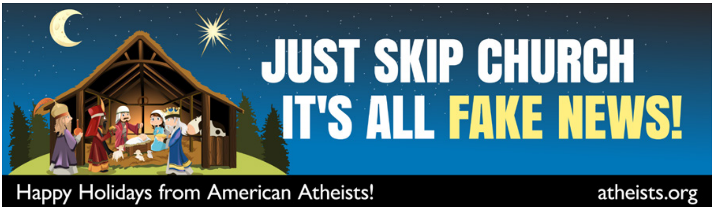
This billboard design appears in the Albuquerque and Dallas markets.