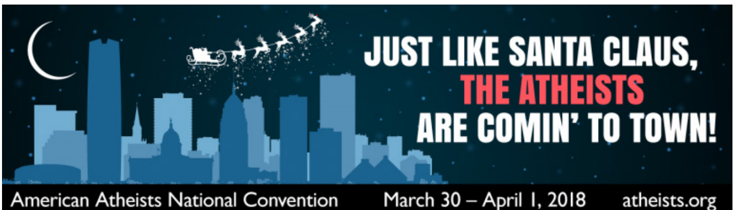
This billboard design appears in the Oklahoma City and Tulsa markets.