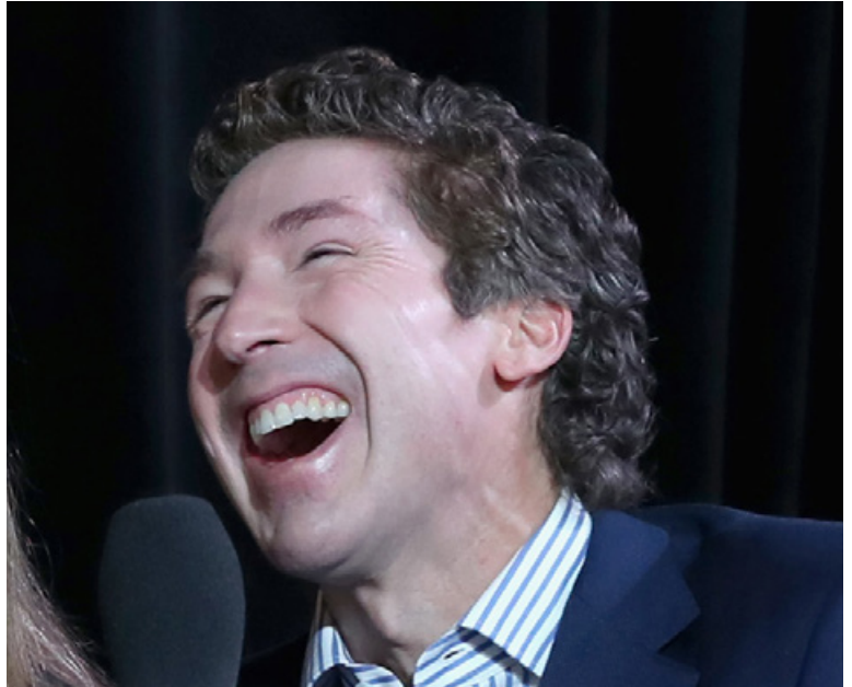
Covid Relief continued on page 5