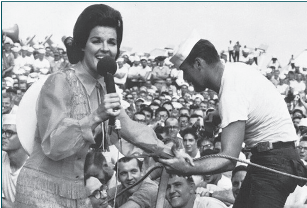
Photo: Anita Bryant at a concert in 1965.

Anita Bryant, despite whatever else she may have accomplished, will forever be linked to religious extremism and hateful homophobia. It did not have to be that way, but it's the legacy she chose. It's an unfortunate one indeed.