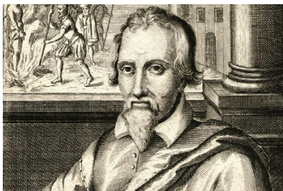
Michael Servetus circa 1511-1553 CE