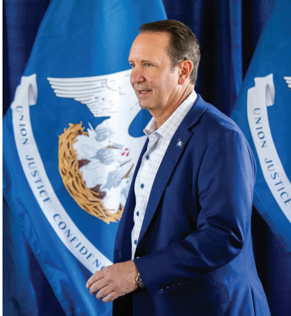
Louisiana Governor Jeff Landry (R)

The lawsuit was filed June 24 by Americans United, the American Civil Liberties Union (both the national office and its Louisiana affiliate) and the Freedom From Religion Foundation with pro bono counsel Simpson Thacher Bartlett LLP. We represent nine Louisiana families from various religious and nonreligious traditions who object to a state-mandated version of the Ten Commandments being forced on their children.